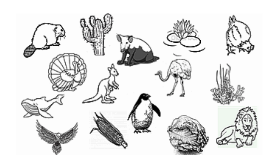
Figure 1: Images used in picture sorting task, presented in the configuration used for the stimulus sheet.

animals that were calibrated with a separate group of adult participants to be cross-classifiable into one of three taxonomic groups (mammal, bird, or plant) and one of three thematic groups (farm, water, and wild/zoo). The assignment of stimuli to thematic groups was based on the results from a questionnaire in which a separate group of adult participants rated the degree to which each possible pair of a broader range of 20 plants and animals belonged to each of the thematic groups on a 7-point Likert scale. Each of the five stimuli assigned to a given thematic group were those that achieved a rating of \geq 5.5 for that group when paired with each of the other four (see Table 1).